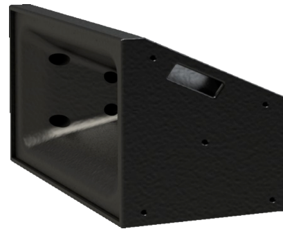
SM96 3/16/2011 4:09:41 PM Danley shop

Synergy Horn Performance in an Ultra-Compact Box