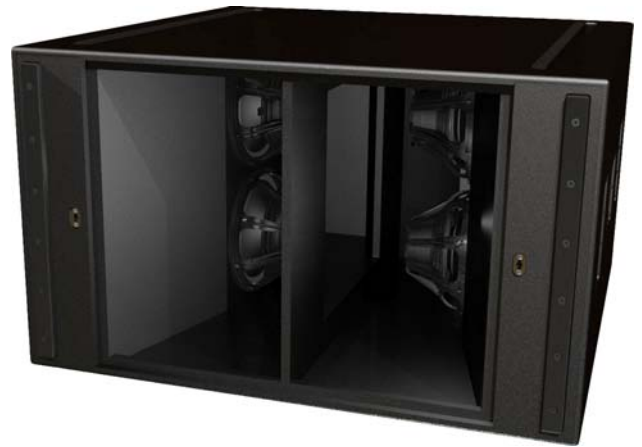
TH412 Outdoors 5/12/2009 10:34:01 AM Outside