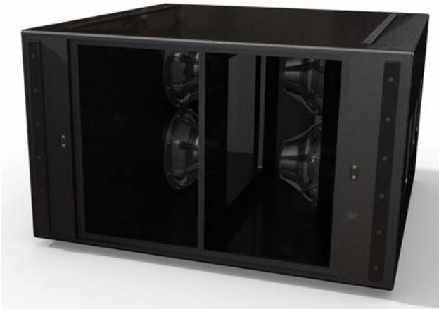
TH412 Outdoors 5/12/2009 10:34:01 AM Outside

TH-412 Giving you both kinds of bass – low and loud!