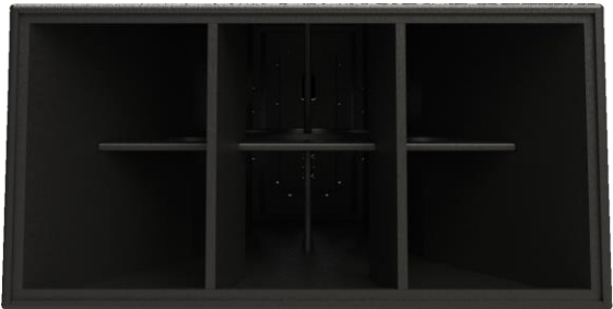
DBH218 6/11/2010 4:15:43 PM