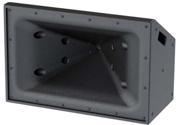
SM96 3/16/2011 4:09:41 PM Danley shop

Synergy Horn Performance in an Ultra-Compact Box